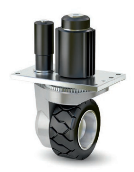
Example for the electromechanical steering of forklift trucks