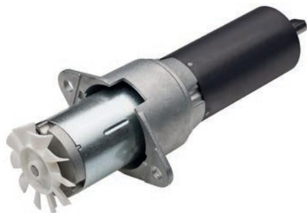
This PM 42 is one of the transmission variants which are used within the ice machines.

Who does not know the sales stalls on promenades, markets and picnic spots in the South, where fruity granitas, tempting sorbets or delicious slush ice are hawked? Ugolini SpA is one of the leading global manufacturers of machines in which refreshing delights are prepared, cooled and constantly mixed to maintain the optimum consistency. The tasty goods are appetizingly displayed in large containers and are continuously mixed. This prevents excessive frosting or formation of lumps.