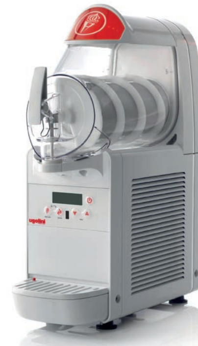
For optimum consistency, the ice cream has to be mixed continuously.

series applications,” Hagedorn states. In the first stage, where the high rotational speed of the motor directly encounters the gear, the ductile planet gears now ensure for the first gear reduction at an even lower torque. This visibly minimizes the noise level. “The accurate implementation of the gearing in this stage is based on decade-long experience of IMS Gear, combined with the most modern simulation calculations,” Hagedorn emphasizes. In the second and the third stages, the spur metal gears then convert the rotational speed into the torque required. Due to a special bearing technology, these gears are optimized for especially long-term durability even at high torques.