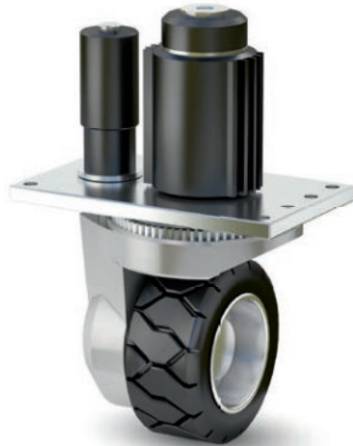
Example for the electromechanical steering of forklift trucks